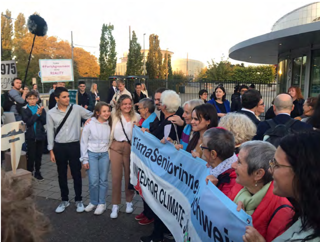
The Portuguese youth applicants stand alongside the members of the Association of Swiss Senior Women for Climate Protection before the European Court of Human Rights.