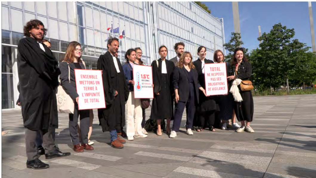
The team in the Notre Affaire à Tous and Others v Total

Total has used the same argument in Notre Affaire à Tous and Others v Total where the claimants relied on Article 789 of the French Code of Civil Procedure to request provisional measures. The applicants' idea was to ensure that, considering the climate urgency and timescales of the procedure, Total – which is one of the leading companies developing new oil and gas fields – can still meaningfully reduce its emissions in line with the 1.5°C objective, by the time the judge will decide on the merits.