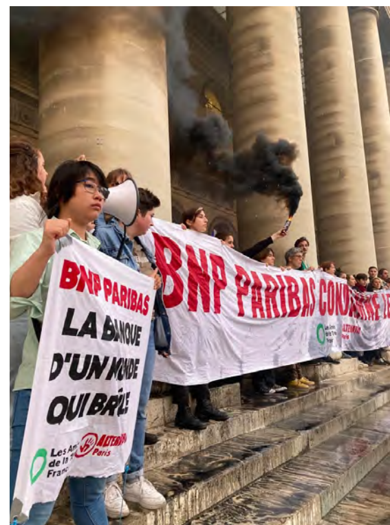
Les Amis de la Terre France members protesting against the BNP Paribas' contributions towards climate change.