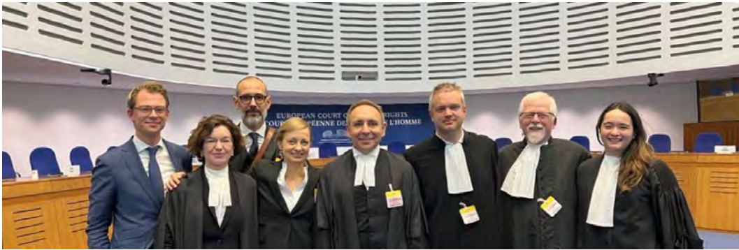
The legal team behind the applicants in the Swiss Senior Women's case in the European Court of Human Rights.

They demonstrated, by reference to evidence from experts in climate change science and the Climate Action Tracker , an independent scientific project that tracks government climate action and measures it against the globally agreed Paris Agreement, that Switzerland's short and long-term GHG emission reduction targets were woefully inadequate (and not embedded in legislation) and that Switzerland has not carried out any studies or due diligence in relation to the requirement to keep global warming below 1.5°C.