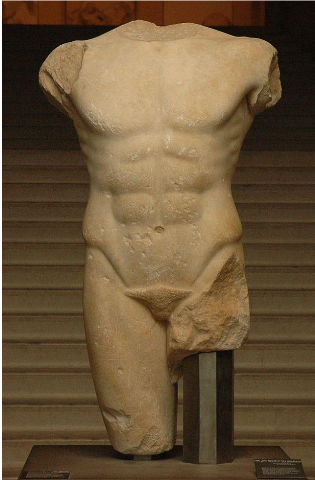
Torso from Miletus, Paris, Louvre